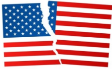
Donald ( King of the Anti-PCs ) Trump